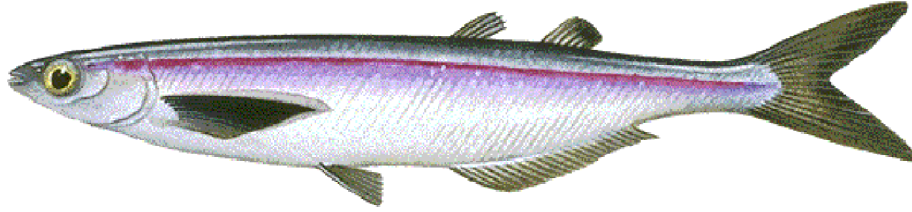
The California Grunion, Leuresthes tenuis (approx. 5 – 7 inches long)