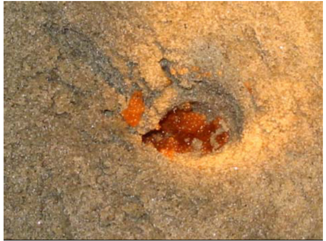
Grunion eggs revealed shortly after spawning

Spawning takes place at a level on the shore that is under water only during the highest tides of the month. The sand on the surface above the eggs becomes dry, but a few inches deeper below, where the eggs are buried, the sand remains moist as do the eggs.