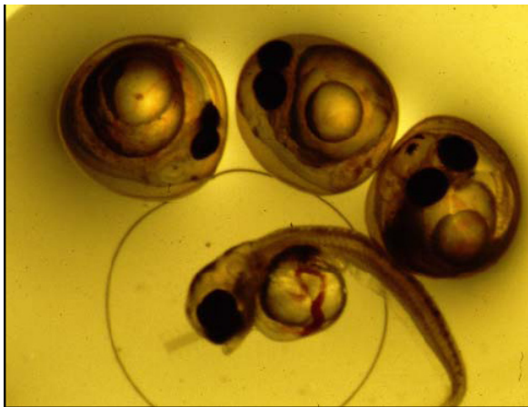
Embryos and Hatchling

At the time of spawning the eggs are filled with a bright orange yolk and easily visible if uncovered. During incubation the yolk is gradually consumed and the developing embryo becomes silver, blending in with the color of the sand. Therefore, a few days after spawning takes place, the eggs become much more difficult to find than they are immediately after spawning. Embryos develop more quickly in warmer temperatures, and are ready to hatch within 10 days at 20°C.