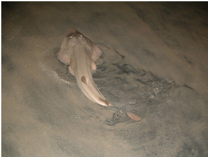
Guitarfish washes ashore to prey on grunion

Spawning grunion have many predators, both in the ocean and on land. Halibut, corbina, guitarfish, seals and sea lions, sharks, dolphins, and squid feed on grunion in the water, while herons, egrets and other birds nab the spawning grunion on shore. Cats, rats, skunks, and other opportunistic predators feed on the grunion when they can catch them.