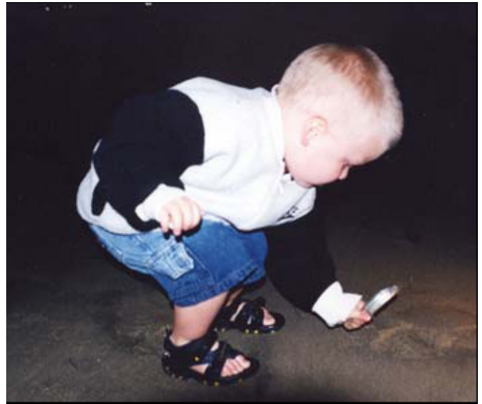
Catching grunion to release

Because of their vulnerability to capture during spawning runs, grunion have been protected since 1927 by the California Department of Fish and Game. During their peak spawning times, no take or capture of grunion is permitted. The closed season includes all runs in the months of April and May. For additional protection, during open season, anglers are not permitted to use any gear of any kind, or to trap the fish. Collection of fish may take place only with bare hands. A fishing license is required for anglers over the age of 16. We encourage “catch and release” of the grunion.