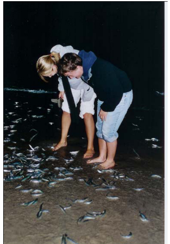
Grunion on the beach

Long term observations indicate that grunion may appear on any part of a sandy beach. Areas that appear to be favored during one spawning season may change in subsequent years. During a spawning run, grunion may spread across the length of an entire beach, or be found in patchy areas or sections, or be focused on only one part of the beach. These areas may be consistent from run to run, or may change as the beach contours and wave direction change over time. Grunion appear to be attracted to areas of freshwater outlets, including storm drains, creeks, and river mouths.