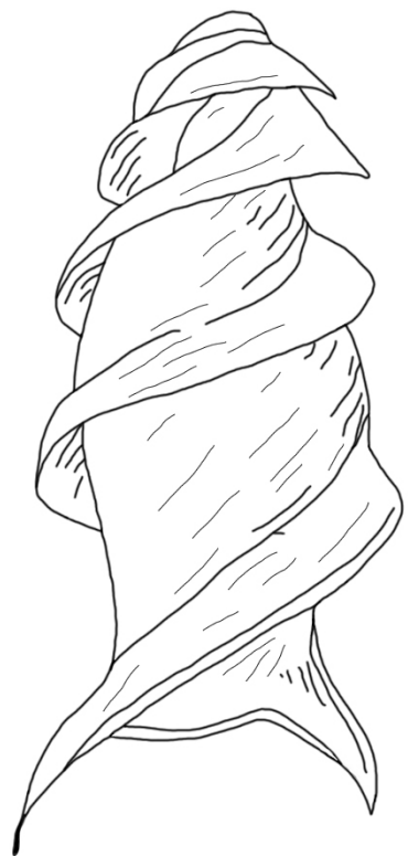
HORN SHARK EGG CASE Heterodontus francisci